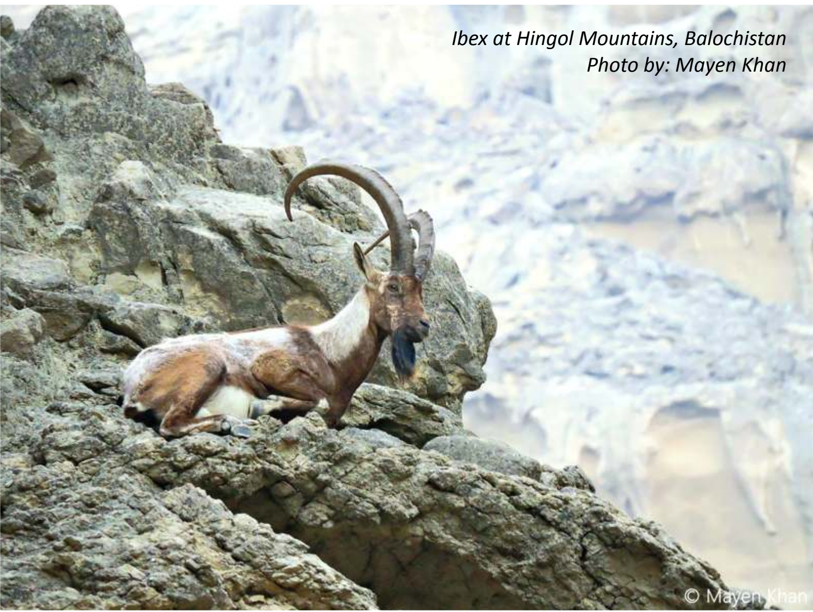
Ibex at Hingol Mountains, Balochistan