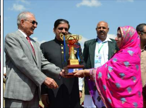
Table Tennis (Male) Single

Balochistan Sports Festival Table Tennis (Male) Championship was held at the PSB Gymnasium from March 24 - 29, 2014. A total number of 18 teams from various Institutions of Balochistan participated in the event.