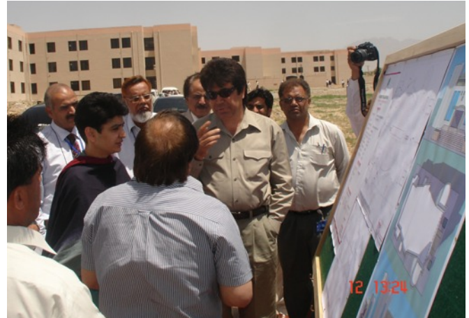
Secretary C&W describing the construction plan.

equipment, side rooms, stage exit and entrance corridors and a vast stage with cinema screen and drama performance facilities. The auditorium will also broaden the scope of holding debates, declamation and recital contests for large number of students not only from BUIITEMS, but also from all over the country.