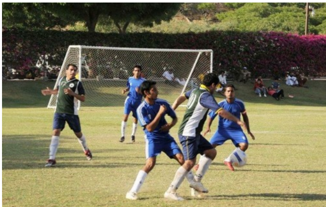
BUIITEMS Football team in action