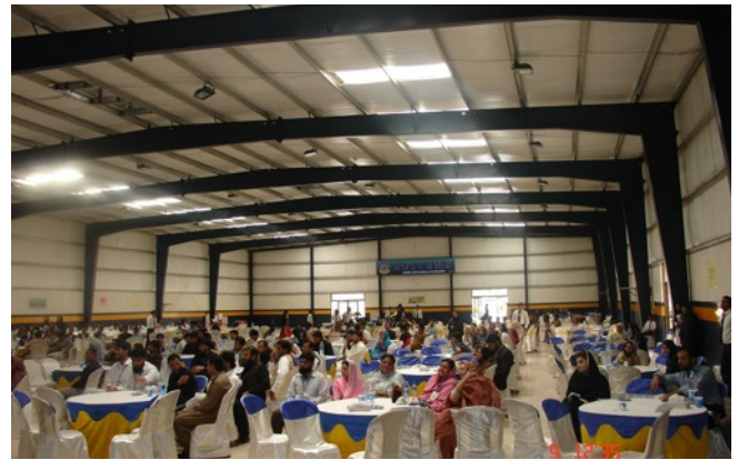
Alumni Homecoming Event in progress

This mega event, took place at the Expo Center. In this first ever event of its type, more