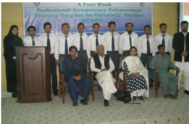
Group photo of participants with guest speaker