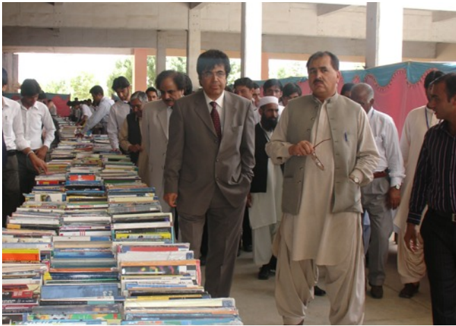
Vice Chancellor & the Chief Guest visiting the stalls

After the formal inauguration of the Book Fair, the provincial secretary for Culture, Tourism and Archives department visited the bookstalls where thousands of books were on display.