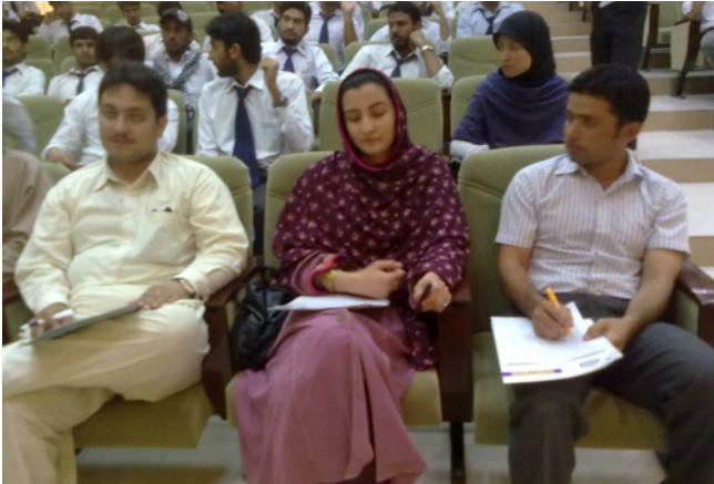
Panel of judges evaluating the speeches.