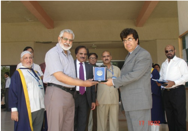
Rector NUST receiving the BUIITEMS shield from the Vice Chancellor