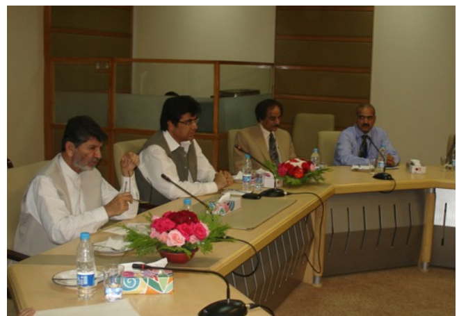
Chief Secretary Balochistan being briefed by the Vice Chancellor