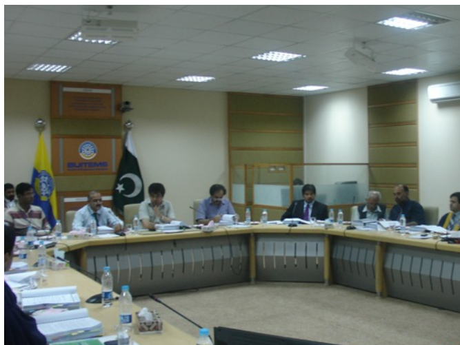
Meeting of B AS&R in progress

Matters relating to publications in recognized journals of HEC and research projects of the BUIITEMS faculty members were discussed at length and recommendations made by the Board on each agenda. The Board also considered suggested titles of theses and proposed external examiners in respect of registered MS and PhD Scholars of different faculties.