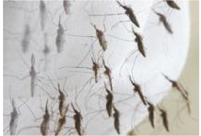
A slide of Mosquito net shown at the seminar