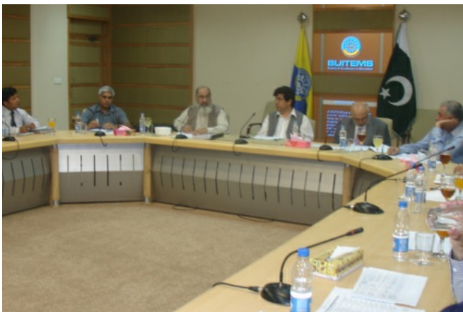
PhD Programs Review Committee Meeting in progress