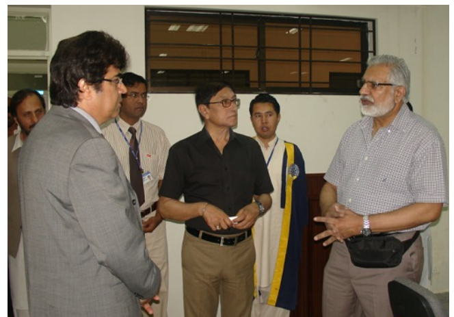
Rector NUST talking to the Vice Chancellor