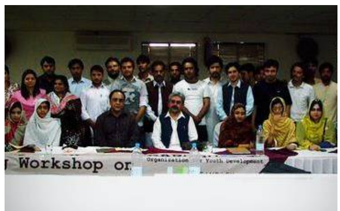
A group photograph of the workshop participants