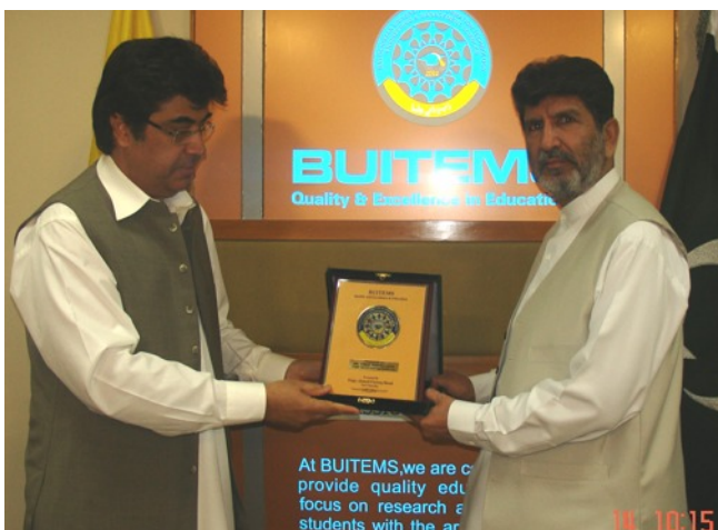
University shield being presented to the Chief Secretary, Balochistan