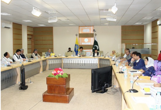
Syndicate Meeting in progress

The newly designated members of the BUIITEMS Syndicate were cordially welcomed on the August body of the University.