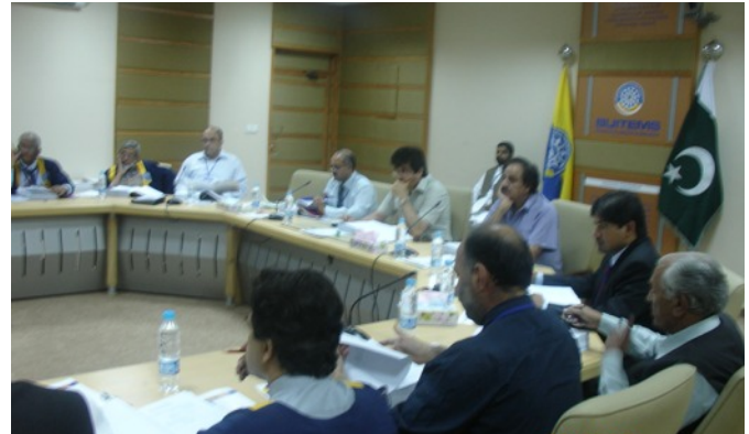
Another section of the participants

The Advanced Studies and Research Board of BUIITEMS also deliberated on the Graduate Academic Rules and made recommendations for the Academic Council.