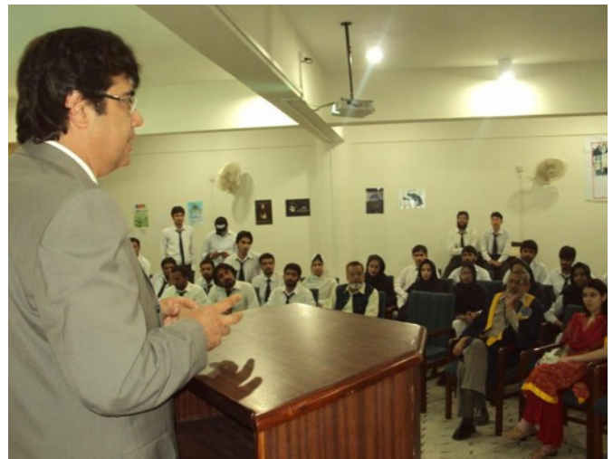
Vice Chancellor addressing the participants