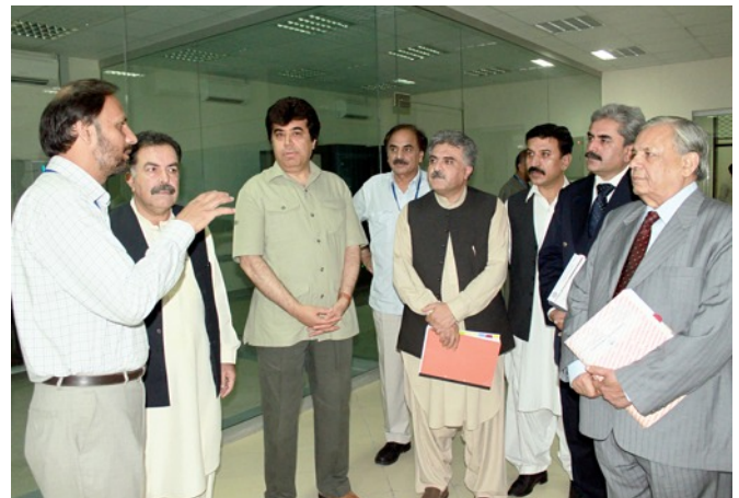
Syndicate members being briefed about CMS

The 16th meeting of the Syndicate of BUIITEMS was held on 14th June, 2011, at Takatu Campus, BUIITEMS under the chairmanship of the Vice Chancellor. The meeting commenced with the recitation of verses from the Holy Quran.