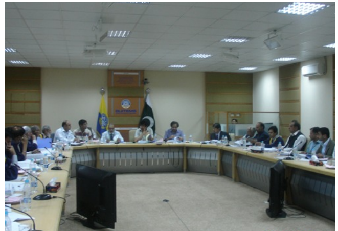
Meeting of the Academic Council in progress

Speaking on the occasion, Vice Chancellor Engr. Ahmed Farooq Bazai praised the performance of the boards of study which pave the way for constant revamping of the curricula in the light of contemporary findings and advancements. He stated that traditional knowledge is to be reinforced by the application of modern technology as the amalgamation of the present and past trends paves the way for the amelioration of the condition of masses in the province.