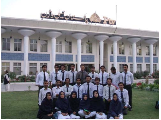
Shaheed Benazir Bhutto Quiz Competition Participants