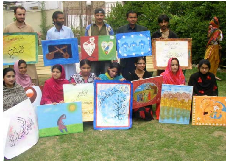
Students with their Painting and Calligraphy

Four universities of Quetta namely University of Balochistan, SBK Women University, Iqra University and BUITEMS participated in the workshop. Thirteen students from BUITEMS attended the workshop. BUITEMS won two