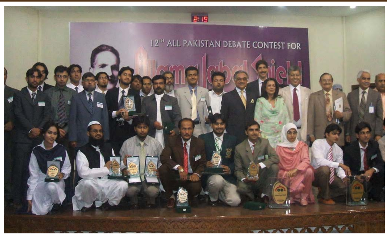
Participants of Allama Iqbal Shield Debate with Chief Guest

remarked: "Debates all over the world are recognized as a major edifying activity. Today, when the people are inclined to pick up the sword instead of using words, the debating societies in the institutions and competitions provide a platform to express oneself and bring a positive change in the society through dialogue, discourse and respect for variance in views".