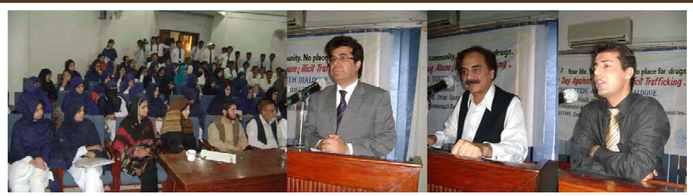
The Vice Chancellor, the pro Vice Chancellor and Director Students Affairs talking to the Audience