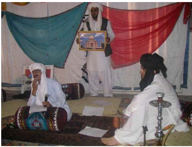
A scene from the Cultural Show