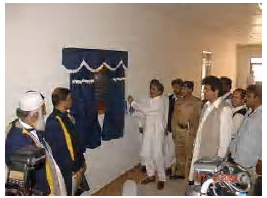
Inauguration of BUITEMS Video Conferencing Facility

extended by him to the university. He optimistically stated that with the provision of the video-conferencing facility, the students of Balochistan would be able to benefit from the lectures of eminent professors from all over the