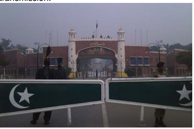
Bab-e-Azadi situated on the Wahga Border

On January 3, the group had the privilege of visiting PTV centre, Lahore. PTV is a valuable source of technical expertise and knowledge for telecommunication engineers. This visit helped the students get know-how of broadcasting, intra broadcasting, inter broadcasting and world wide transmission.