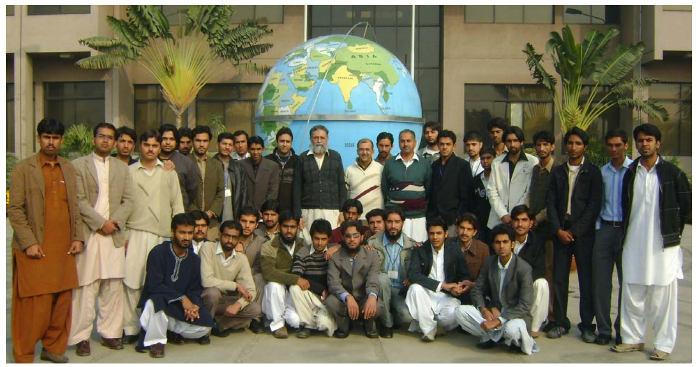
Students' delegation from BS Telecommunication Engineering