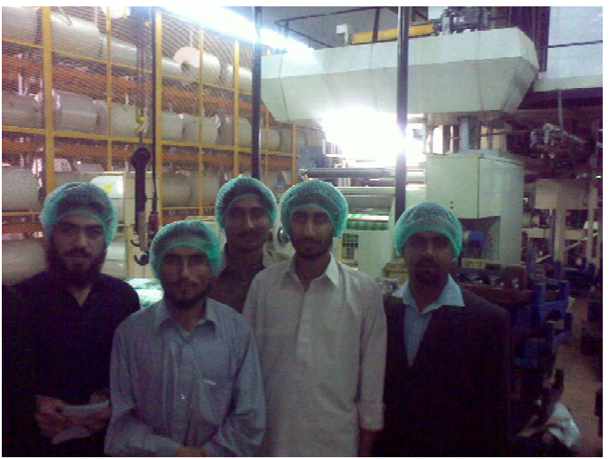
Students visiting Power Generation Unit

The next day visit was to "Packages Limited" which is a joint venture of Ali group of Pakistan & Akerund & Rausing group of Sweden. The Group's principal