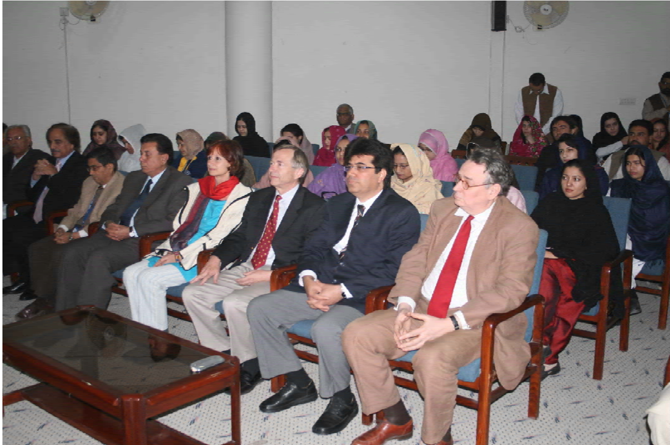
Briefing to the Ambassador in Progress