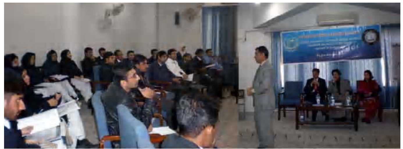
Training workshop in Progress

A one day workshop on the effective use of HEC Digital Library was jointly organized by the Higher Education Commission Pakistan and Balochistan