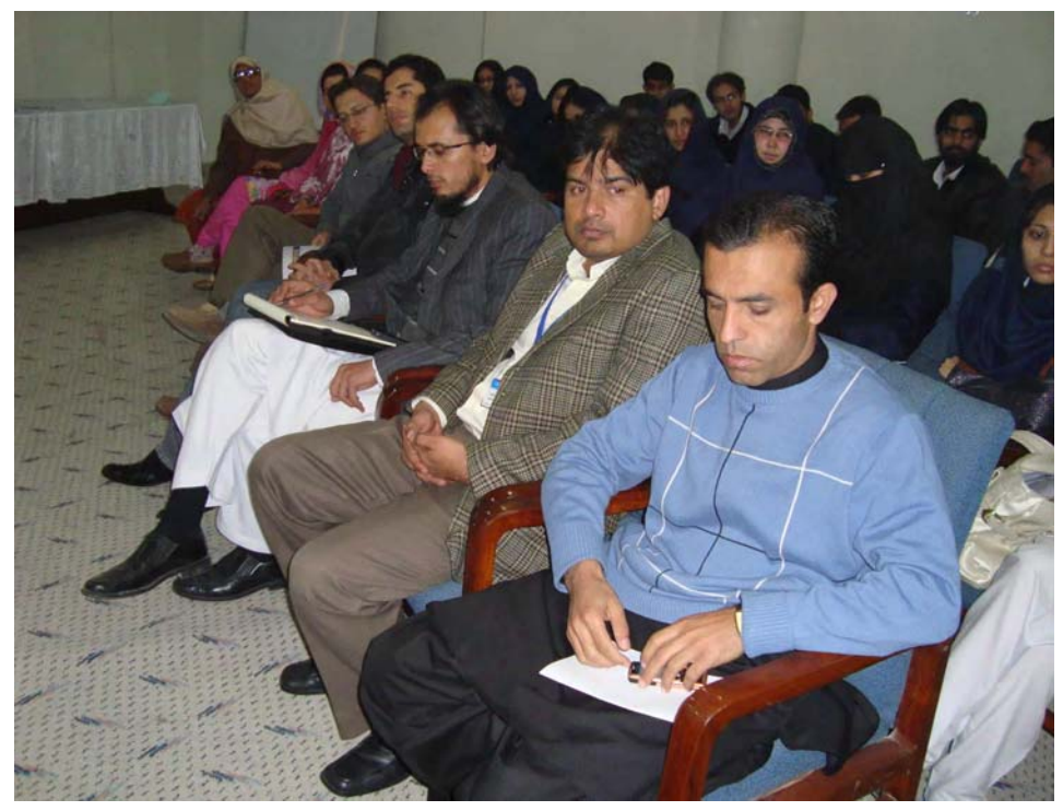
Participants of the Seminar

compensation with the help of distinctive examples. They shared their experiences regarding pay structures and pay level of banking and telecom sectors specially those of their own companies.