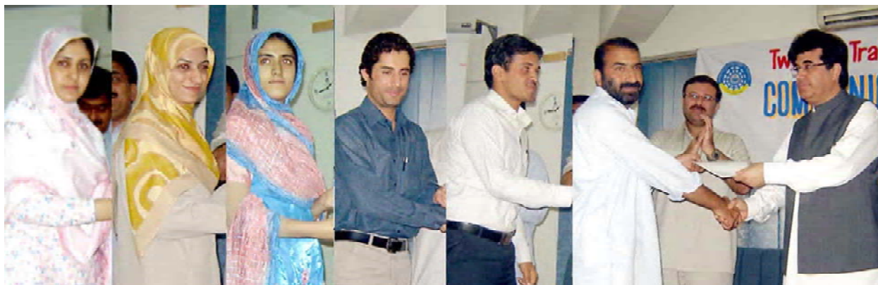
Vice Chancellor BUIITEMS distributing certificates among the participants