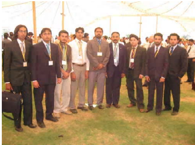
A Group of BUIITEMS delegates

ATC has become a forum which helps all its participants to expand and stretch the horizons of their knowledge and thoughts. This year the Annual Technical Conference was organized by " Society of Petroleum Engineers (SPE) " in Serena Hotel Islamabad. The theme for this event was " Tight Gas Reservoirs Development-Challenge for the industry ".