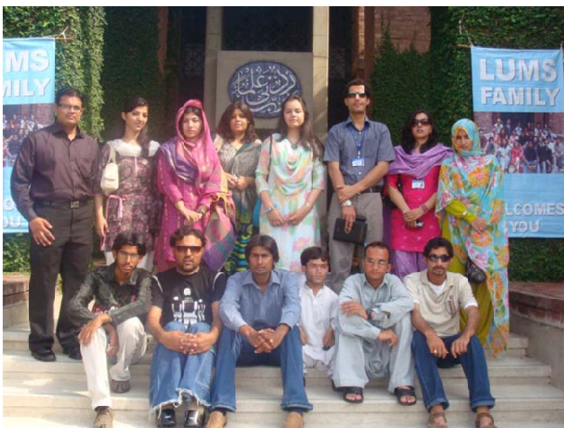
BUIITEMS students at LUMS, Lahore