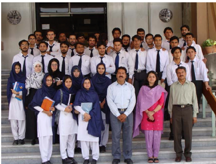
BUIITEMS Students with Chief Manager, SBP