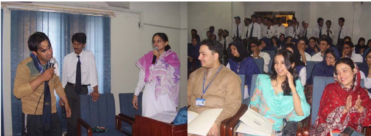
Drama BUIITEMS HEE TO HAI