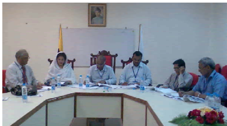
Meeting of Board of Studies in Physics in progress