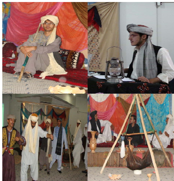
Scenes from the cultural show