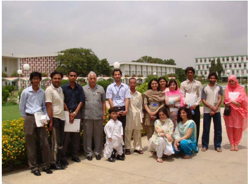
BUIITEMS students with Registrar, IBA Karachi