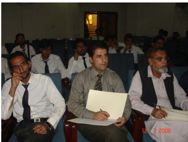
Judges assessing the speakers

Debates and Declamation Contests are great opportunities for the students to express and deliver what they think and feel about the world around them. An All Pakistan Bilingual Allama Iqbal Shield Debate Contest was organized under the umbrella of Higher Education Commission (HEC) Islamabad with collaboration of the Directorate of Students