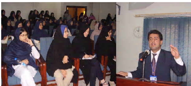
A section of Iranian students group

At the end of the visit delegation expressed their gratitude for the cooperation of BUIITEMS. They were highly impressed by the quality of teaching being imparted at the university.