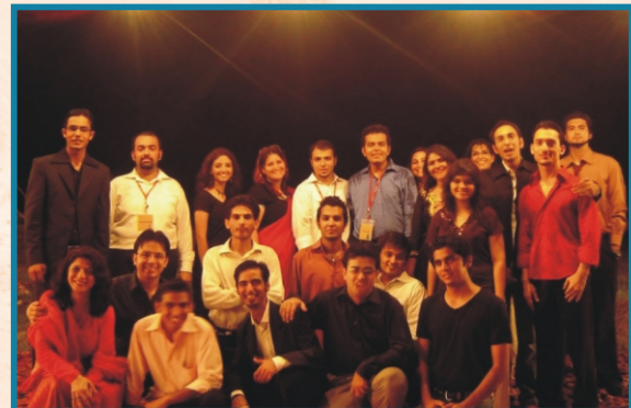
SoL team at the time of Gala Dinner Sponsored by Bank Alfalah on day 5

In a keynote session “Governance” the speaker told the participants about the governance that what Governance is? And also gave political concepts and told about the terminologies. After the keynote session the speaker announced the result of election and then the process of formulation of ministry started.