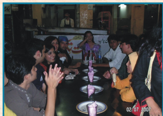
Participants in gwalmandi on dinner

On Day 2 different activities were done regarding celebrating diversity, goal setting & visioning and also study modules were told by young facilitators to the participants so that they can prepare their selves for next four days.