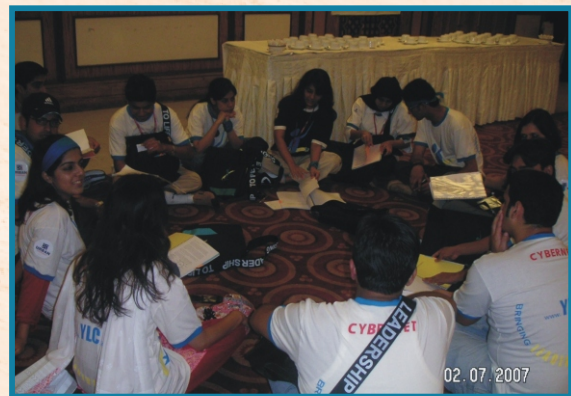
Participants in a Group discussion

The sessions explored the impact of media, cultural stereotypes and societies demand on today's youth and focuses as to where are we headed and in the process of gaining direction, are we discovering growth or losing identity?