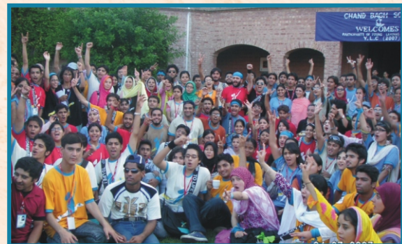
Group photo of YLC participants

Day 6 was the last day of YOUNG LEADERS CONFERENCE. Which was started with the second round of summit in which ministry debate on the Bill and the closing ceremony. Every participant body was assigned a project on any social problem with solution. Shields were distributed among the participants at the .