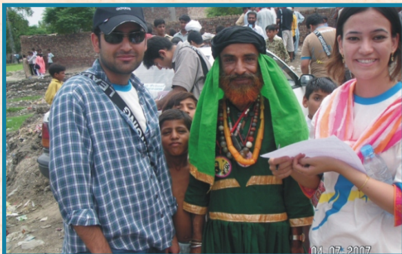
Participants in the Village doing the activity

On day 4 the participants moved to Chand Bagh foundation, (a residential school) Shaikhupura. Participants were divided into the group of 3 or 4 under consideration of young facilitators and management team.