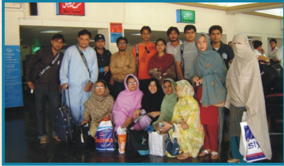
Group photo of Quetta Participants