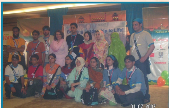
A group photo of Balochistan Participant with Manager of HUBCO

During the 1 st session a short introduction of YLC was made to the participants. All the CEO of the above mentioned companies shared their ideas with young energetic leaders. All the participants were divided in 20 groups each group had 15 students and a young facilitator from the management who guided them throughout the six days. Where as the young facilitators were guided by the management team.