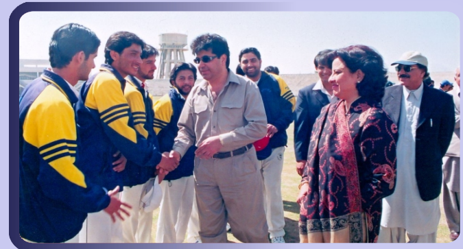
BUITMS cricket team being introduced

It has so far managed the teams of Cricket, Football, Hockey, Badminton (male/female), Table Tennis (male/female), Basketball (male/female), Volleyball, Boxing, Athletics (male/female), Squash, Karate, Body building, Weightlifting, Swimming, Rifle shooting, Tennis and Chess. The players of various sports teams of BUITMS participated in different tournaments both provincial and national level and achieved distinguished positions.