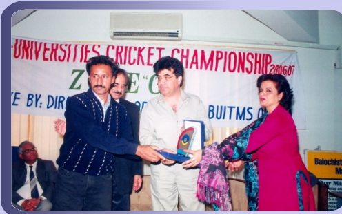
Manager of Khairpur team receiving the shield