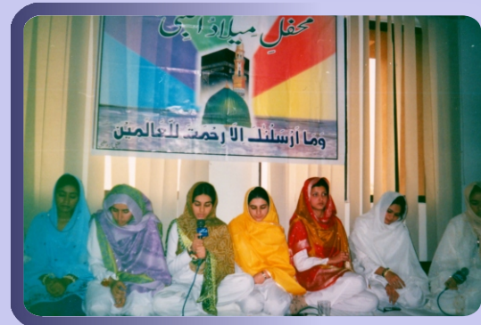
A group of female Naat khwans

In the holy month of Rabi-ul-Awal all the Muslims experience a very different pattern of life. They try to get themselves involved in all such spiritual activities that provide a chance to them to ask for the condonation of their sins from Almighty Allah.