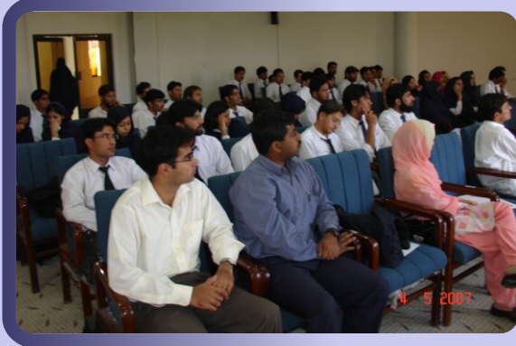
A section of audience

It was incorporated as a Limited Company under the Companies Ordinance, 1984 on May 31, 2001 with an authorized capital of Rs.50 Million. It obtained certificated of commencement of business on July 12, 2005. Currently 10 branches of HUM Securities are operating in Pakistan.