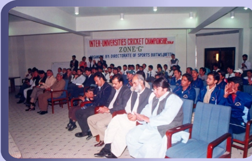
Officials from the guest teams