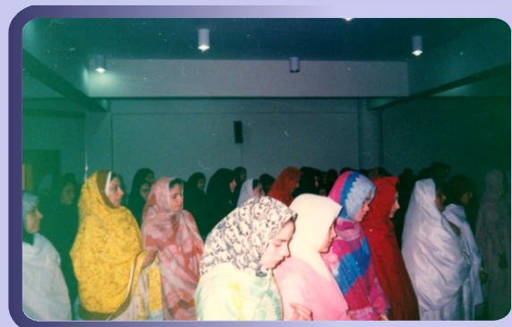
Participants standing to offer salam

Eid-e-Milad-un-Nabi (Peace Be Upon Him) is a very important celebration for Muslims. On this day all the Muslims offer special prayers as thanks giving to Almighty Allah for sending Prophet Muhammad (Peace Be Upon Him) for the salvation of mankind. This most important occasion is the time for remembering the various favors bestowed by Allah Almighty: the first is the revelation of Holy Quran with its instructions, the institution of an ever living guide that would continue to illuminate Muslims path according to the needs of the time.