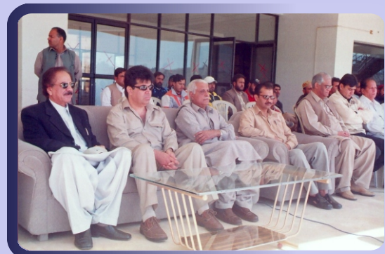
VC with elite faculty at the stadium

In the same context, the Directorate of Sports of Balochistan University of Information Technology and Management Sciences (BUIITMS) conducted All Pakistan-Inter Universities Cricket Tournament Zone (G) at Ayub Stadium Quetta on Sunday, March 25, 2007. Cricket teams from various universities of Sindh and Balochistan participated in the tournament.