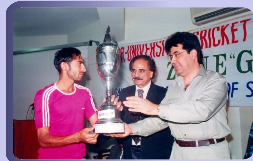
Runner up trophy being awarded

The tournament went on for three consecutive days and interesting matches were played among the various teams of zone G (Sindh and Balochistan) which were much enjoyed by the spectators.