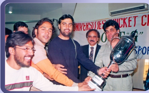
Championship trophy being awarded

In reply, BUITMS achieved the target for the loss of six wickets. Fareed contributed 36 runs in the BUITMS's win. Imran was unbeaten at 31. Sami added 27 while Naseeb was not out at 19 runs. The host BUITMS also benefited from 42 runs they got from extras. That proves that match was closely contested in all spheres of the game. Raheel got two wickets while Shafiq and Sami secured one wicket each for the visiting side.