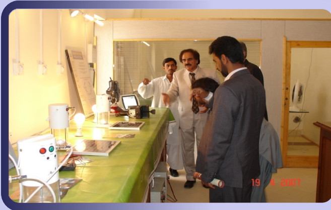
Delegation members in the electronics lab