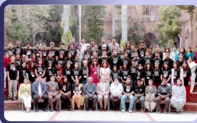
Drama teams from 10 universities

The included teams were from Bahaddin Zakariya University, Multan, Fatima Jinnah Women University, Rawalpindi, Shri Ram College University Delhi, Punjab University, Lahore, Kamla Nehru College, Delhi, Govt. College University, Lahore, Indus Valley School, Karachi, BUITMS, Quetta and Ghulam Ishaque Khan Institute, Topi Sawabi.