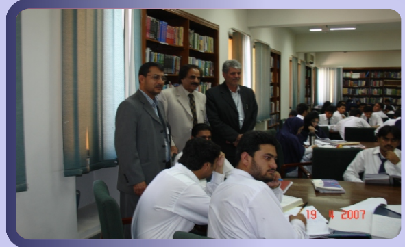
Some of the visitors in BUIITMS library