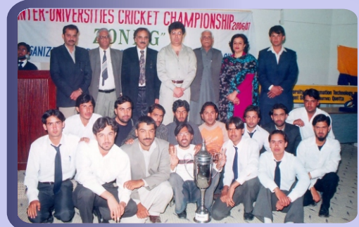
Group photograph of the victorious team