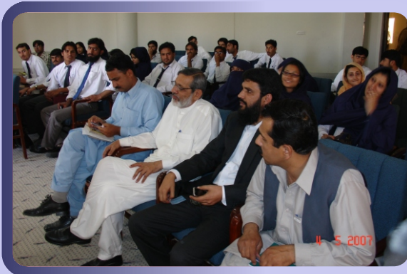
Another group of participants

It was incorporated as a Limited Company under the Companies Ordinance, 1984 on May 31, 2001 with an authorized capital of Rs.50 Million. It obtained certificated of commencement of business on July 12, 2005. Currently 10 branches of HUM Securities are operating in Pakistan.