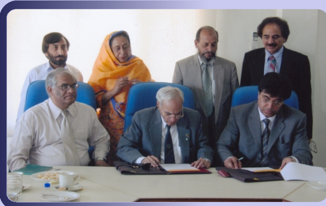
VC and Chairman PSF signing the MOU

After the visit, the delegation and the hosts assembled in the syndicate room of the Takatu Campus where the M.O.U was formally signed. The foundation accepted the responsibilities of building construction, electrification and furnishing and other allied tasks.