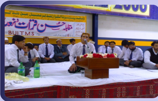
Participants of Hus- e-Qirat contest

Both the competitions were so inspirational and attention grabbing that not only the audience but also the judges at the end were in a dilemma as to who should be awarded the positions. However the top three positions in Qiraat Competition were declared as