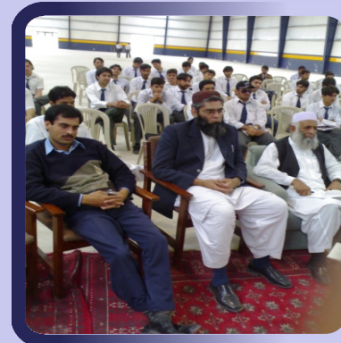
Judges for the competition

It seemed that the competitors mixed up their vocal prowess with deep love for the Holy Prophet (P.B.U.H) and this emotional mixture of devotion and talent produced spiritual inspiration for the audience. The very message of Holy Quran, that Allah Almighty and his angel keep on sending 'Darood' on to the Holy Prophet (P.B.U.H) and all the believers are exhorted to keep on doing so, as long as they have to live in this world, was seen to have deeply influenced the audience.