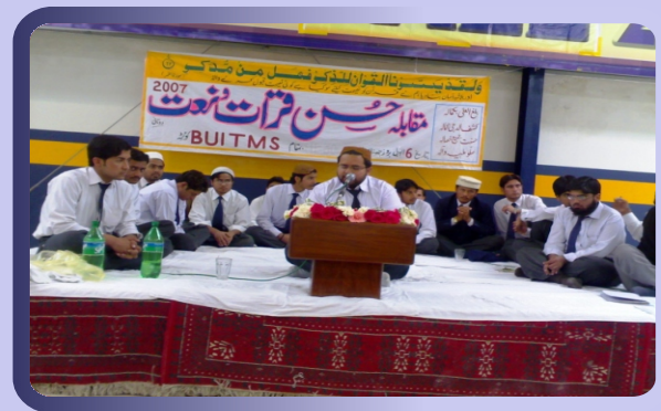
Participants of Naat Khawani contest

The atmosphere at the Expo Centre was soaked in the spiritual glow when the competitors displayed their skills in recitation of the Holy verses. The audience were moved to say Subhan Allah, when ever a qari stopped for breath. The rendition of naats was equally inspiring.