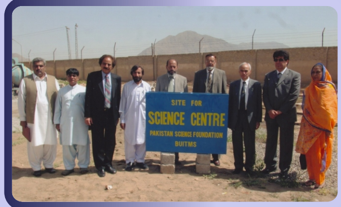
Science Foundation delegation on the site

The delegation then moved to Takatu Campus for on-site demarcation of the piece of land where proposed Science Centre would be located.