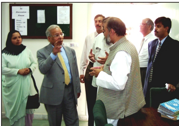
Governor SBP and VC BUITMS discussing academic issues