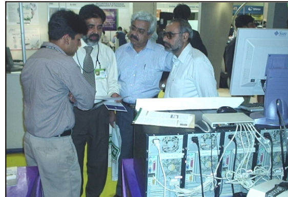
Parallel Cluster Display