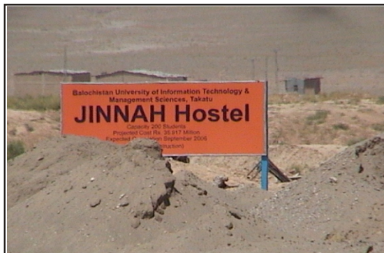
Site of Jinnah Hostel