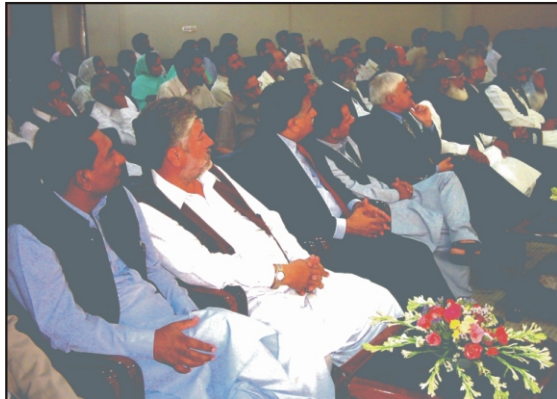
Audience listening to Governor SBP

mainly the future prospects of Pakistan's economy and its growth. The Honorable Governor elaborated the policy decisions taken in this regard. He brought in limelight the efforts of present government being carried out, in order to provide sound footings for the debilitated economy in this age of Globalization.