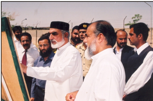
Site of Wind Tunnel under discussion

The energy sector in Pakistan is under constant threat because of the population growth, rapid industrialization and fast diminishing traditional power generation resources. The government of Pakistan has stressed upon the need for developing alternative energy sources to meet the growing needs of electricity in the country. Because of the situation in