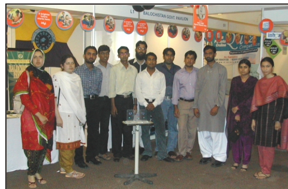
Group photo of BUITMS team

A team of BUITMS students participated in an IT Exhibition, Conference and Quiz Competition held in Pearl Continental, Peshawar. It was organized with the joint collaboration of Brains Education, Peshawar and E-Commerce Gateway, Singapore.