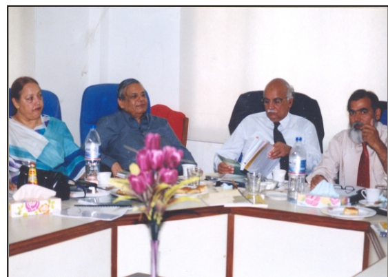
Some members of the Syndicate