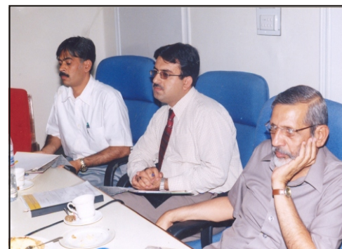
Syndicate members listening to VC

The Future Plan of the university was also approved after detailed discussion and incorporation of additions and amendments suggested by the honorable members. The members also gave approval to the contracts awarded for the construction projects in the university.