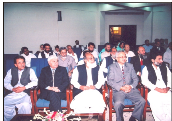
Audience listening to Governor SBP

In his address, the Governor SBP applauded the excellent work done by the VC and his team for amelioration of educational standard and touching new milestones in the history of Balochistan. He extolled the untiring efforts of Vice Chancellor and his colleagues including Deans, Chairpersons, Faculty Members and Administrative Staff for creating a conducive atmosphere for learning in a less developed area. He also praised the efforts for spreading quality education but on the other hand he also emphasized the need for improvement in all aspects of education by focusing more on practical research efforts. He emphatically mentioned that improvement should be there in order to meet competition in the job market where the leading institutes of the country are also standing with their highly qualified graduates.