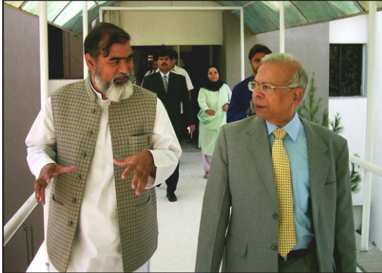
Governor SBP and VC BUITMS taking a round of the campus

BUITMS had the privilege of being visited by His Excellency Dr. Ishrat Hussain, Governor State Bank of Pakistan, on July 22, 2005.