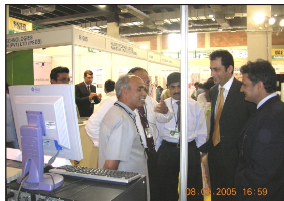
Guests taking interest in BUITMS Displays

The stall was organized with the cooperation of IT Department Government of Balochistan for the representation of the BUITMS in particular and the province of Balochistan in general.