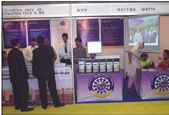
BUITMS Stall at ITCN 2005