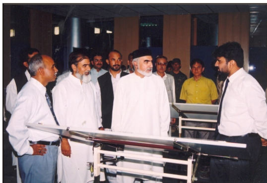
Governor Balochistan in Drawing Section

17 th August, 2005 was a memorable day in the brief history of Balochistan University of Information Technology & Management Sciences, when the Honorable Governor Balochistan, Engineer Owais Ahmed Ghani, laid the foundation stone of Jinnah Hostel of BUITMS, at Takatu Campus.