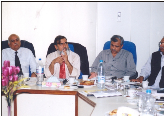
Syndicate meeting in progress

Of Computer and Emerging Science Faculty of BUITMS. The members were greatly impressed by the rapid pace of development and expressed their appreciation for the relentless effort, drive and vision of the Vice Chancellor for establishing the state of art laboratories in the field of Computers, Electronics and Telecommunication in a short duration of less than 2 years. They observed that the provision of excellent scientific laboratories and educational environment will greatly help the students of this university compete with the alumni of good foreign universities.