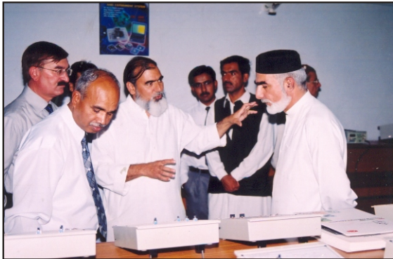
VC BUITMS explaining the project

The Vice Chancellor BUITMS gave a presentation to the distinguished guests about the University. This included information about the three campuses and facilities being provided, existing and future programs of studies in different faculties, research set up including new labs and projects, faculty development, students' enrollment and lastly the future direction and vision for this university.