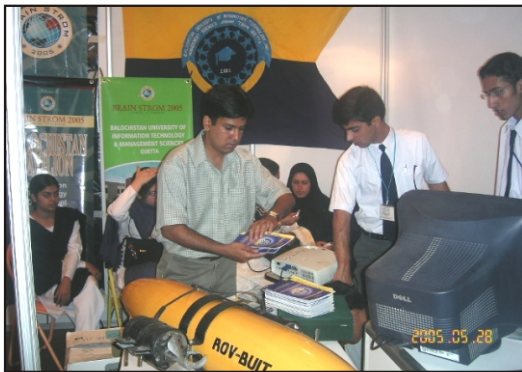
Project displayed in Brain Storm

As a result, they formed Joint Venture with their company name, City Soft with two major companies, namely: