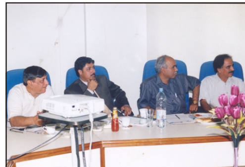
Syndicate members listening to VC

After detailed discussion, guidance and advice by the honorable members for certain amendments and changes, the proposals of BUITMS on the above mentioned issues were approved.