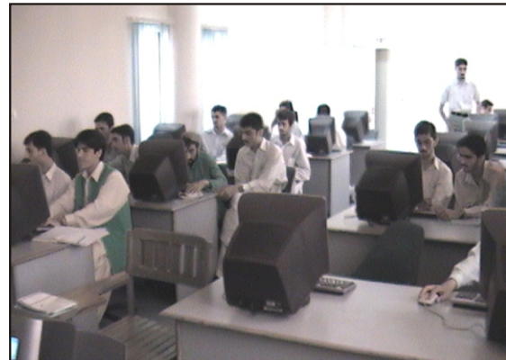
Free IT class in progress

The opportunity of acquiring basic and advanced computer skills. This indicates that both our youths and grown; ups are fast realizing the importance of IT for moving upward in all professional spheres. The provision of physical facilities like computers and computer accessories, internet connections etc was undertaken by the BUIITMS without charging a single paisa from the participants.