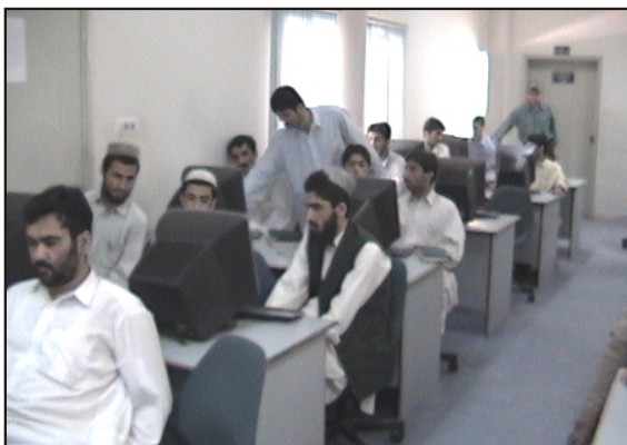
Free IT class in progress

Living up to her commitment of propagating and disseminating knowledge in the domain of Computer literacy and Computer applications amongst the general populace of the province, the Balochistan University of Information Technology and Management Sciences arranged the 6 th Free IT Awareness Program from 6 th August to 2 nd of September, 2005. A remarkable feature of the program was that it was simultaneously conducted at the city campus as well as at the Takatu Campus of BUIITMS. As usual, the program was conducted with the help of volunteer students during the semester break.