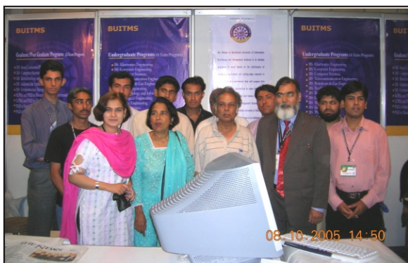
BUITMS Team at ITCN 2005

ITCN Asia 2005 is the 5 th consecutive IT annual event which took place in Karachi on August 9 -11, 2005. Balochistan University of Information Technology & Management Sciences has completed its three years of existence and is participating in this Mega event every year with innovative projects on display and full participation by students and faculty members. This is the forum which provides a good interaction with software/hardware companies and yields long term