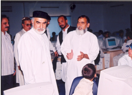
Governor Balochistan visiting Free IT class at BUIITMS

Living up to her commitment of propagating and disseminating knowledge in the domain of Computer literacy and Computer applications amongst the general populace of the province, the Balochistan University of Information Technology and Management Sciences arranged the 6 th Free IT Awareness Program from 6 th August to 2 nd of September, 2005. A remarkable feature of the program was that it was simultaneously conducted at the city campus as well as at the Takatu Campus of BUIITMS. As usual, the program was conducted with the help of volunteer students during the semester break.