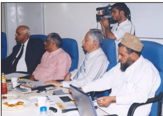
Some members of the Syndicate

The members visited the ongoing civil work, which includes the construction of the Faculty Hostel, Students Hostel, Vice Chancellor's Residence and the renovation and retrofitting of Hall No 1 which will provide additional class rooms, seminar hall, computer laboratories, Chemistry Laboratory and faculty offices.