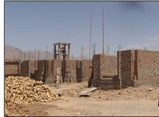
Construction work in progress