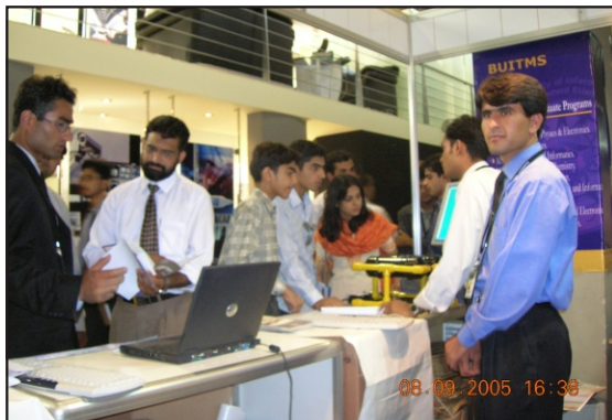
Remotely Operated Vehicle on display