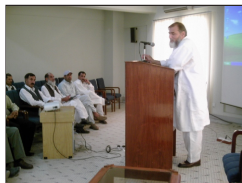
VC Addressing the Trainees

The H.E.C has embarked upon a series of training programs aimed at enhancing the effectiveness of the faculty and teachers at the higher education level. BUITMS is one of the centers selected by the Higher Education Commission for the purpose and two such programs have successfully been arranged. The feedback received from the trainees is highly encouraging and heart-warming as the young teachers were provided opportunities for realizing their own potential and the knack of marshalling and utilizing the available resources, however modest they may be.