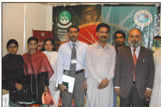
Guests at the BUITMS Stall

In hardware, a Robotic Arm interfaced through computer and Remotely Operated Vehicle (ROV) were the center of attraction at the Balochistan Pavilion. The Robotic Arm has already won First Prize in 2 nd All Pakistan Inter-Universities Competition under the Hardware Project Designing category organized by SAFE and HEC held in late 2004. ROV is a unique mega-project and the first of its kind all over Pakistan and it will be a big contribution towards Pakistan Defense after its early completion.