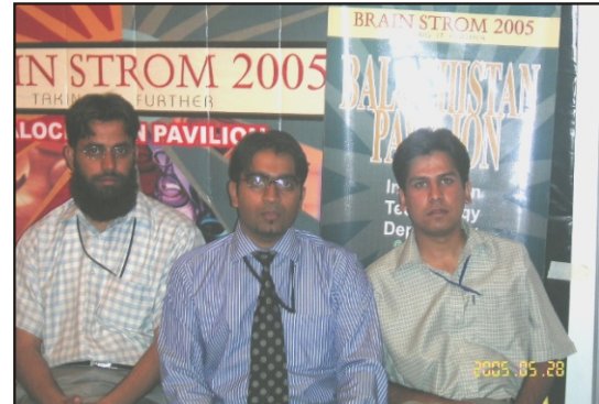
Faculty BUITMS led the team

The students who appeared have got high percentages of 85-95. Since it is online series of Quizzes, further phases will be conducted via web in which the students will appear from Quetta. It was jointly organized by Virtual Academy, Pakistan and Brains, Peshawar.