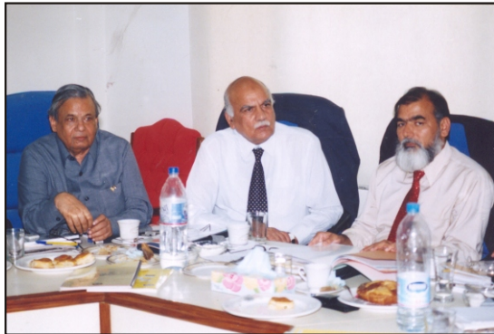
Syndicate Meeting in Progress