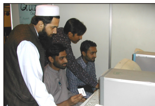
Students displaying the projects

Students from BUITMS were very enthusiastic in taking part in all the events of the exhibition. Both software and hardware projects prepared by them earned a huge amount of appreciation from the audience. Their hard work commitment and the university as a whole won immense applause for making it all possible.